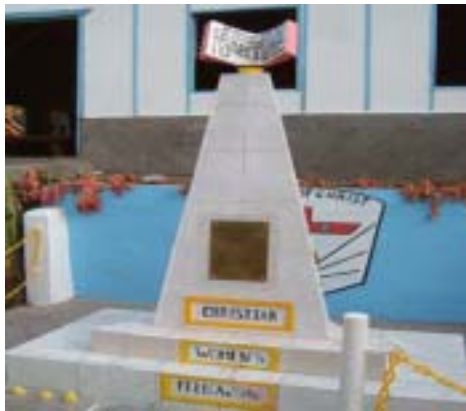
CWF memorial stone and plaque