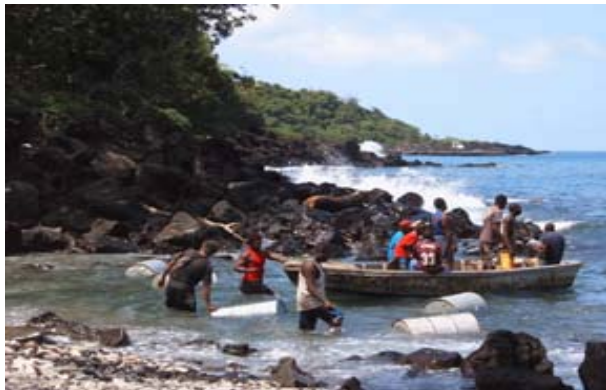
Women arriving by boat for the huge celebration