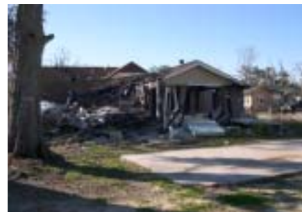
A house yet to be repaired