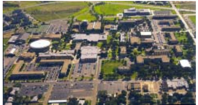
ACU Campus in Abilene

In addition to a full catalogue of undergraduate courses and majors Abilene also offers several outstanding graduate departments and schools. The Graduate School of Theology , founded in 1999 from the Graduate Department of Bible. The mission of the Graduate School is “to equip men and women in effective ministerial leadership in a variety of missions and ministry contexts and to provide strong academic foundations for theological inquiry.” Students from all over the world can enrol in degree programs including the Master of Divinity, M.A. in Christian Ministry, M.A. in Missions, History and Theology, Old Testament, New Testament as well as the Doctor of Ministry degree. One notable feature of the physical campus is an eight-foot-diameter World Missions Globe that is representative of the university’s mission to educate students for Christian service and leadership throughout the world. In this regard, one significant opportunity in the undergraduate department of Bible is the WorldWide Witness program that allows students and graduates to serve God through short-term involvement with experienced mentors on the mission field through summer internships lasting six weeks or apprenticeships after graduation, lasting six to eighteen months.